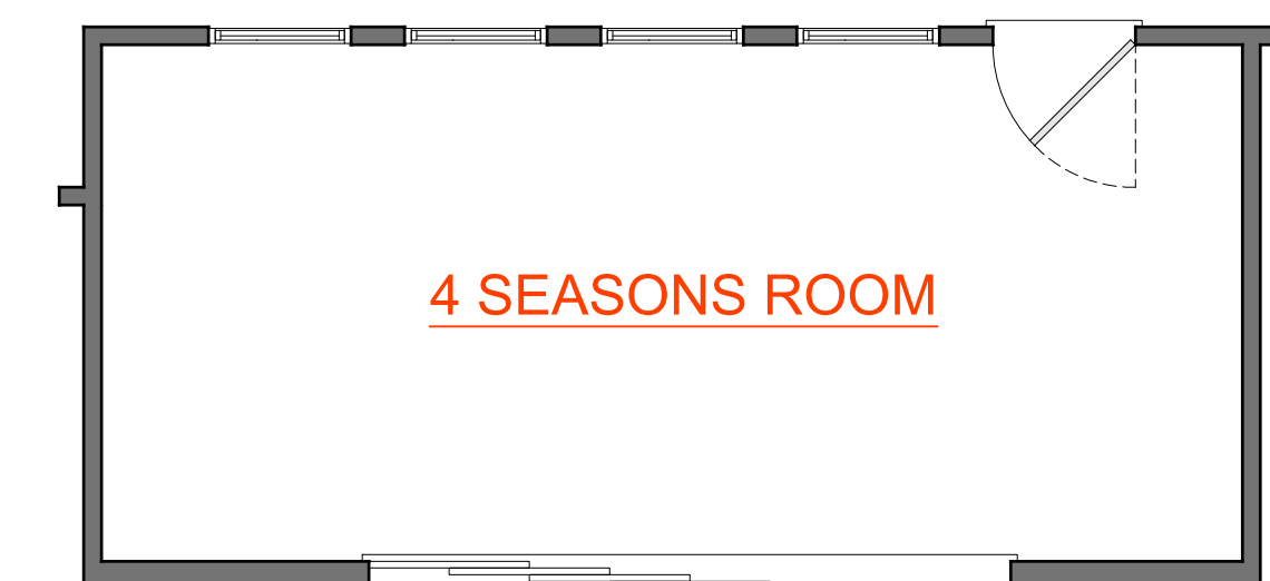
3 / A4.0 PLAN: opt. 4 seasons room 214 SQUARE FEET - 4 SEASONS ROOM