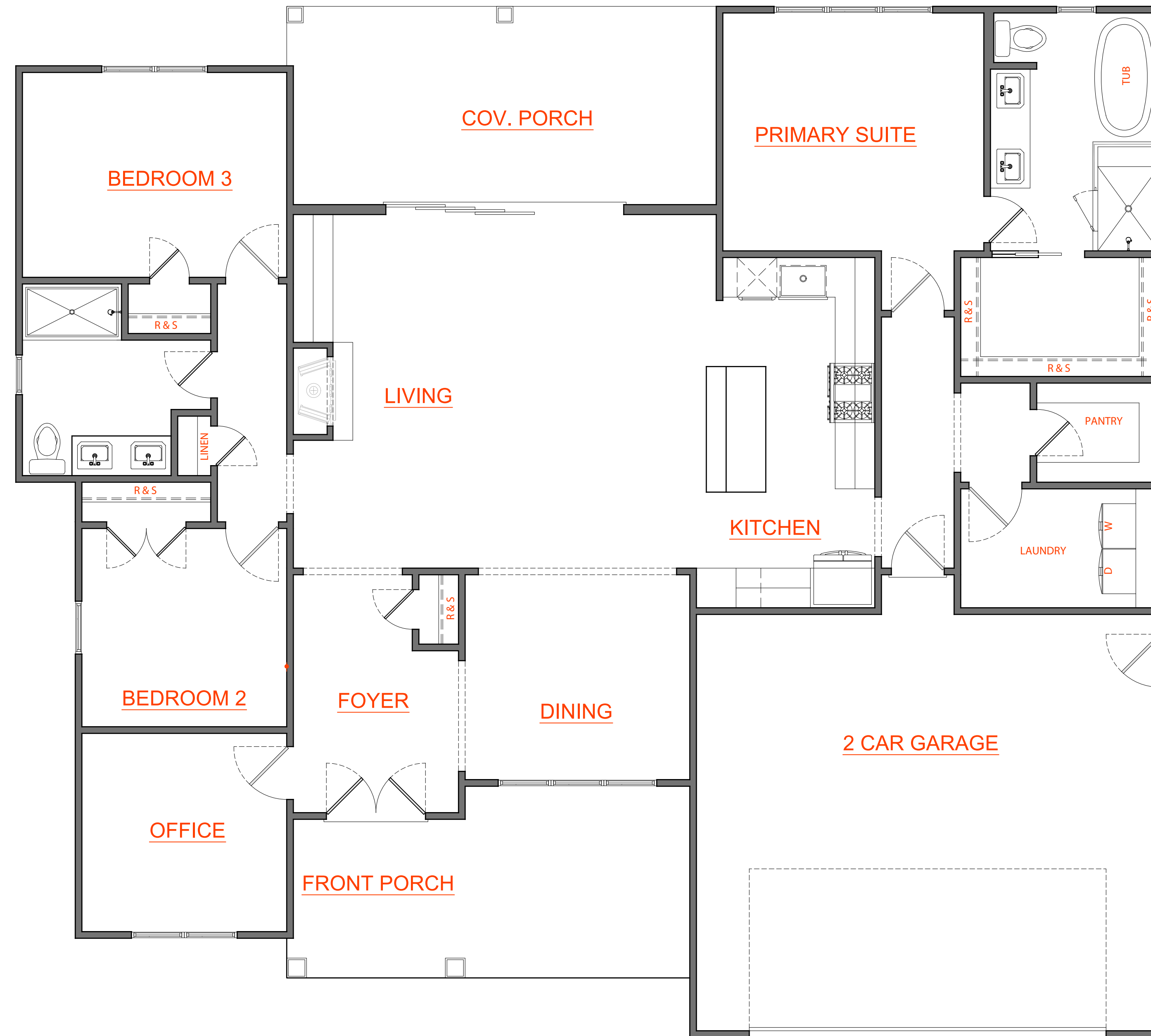
1 / A4.0 PLAN: first floor 1,866 HEATED SQUARE FEET 214 SQUARE FEET - COV. PORCH 516 SQUARE FEET - GARAGE 180 SQUARE FEET - FRONT PORCH

658 Hickory Branch Dr Belville, NC 28451 p: [910] 465.9337 e: corey@slighhomes.com w: www.slighhomes.com